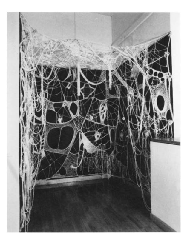
Faith Wilding. Crocheted Environment (Womb Room). Reconstituted installation at the Bronx Museum. 1995.

industrial production, Minimal art had voided the traditional standards of aesthetic distinction based on the handiwork of the artist as the signifier of authenticity. However, as the Ace Gallery case amply reveals, despite the withdrawal of such signifiers, authorship and authenticity remain in site-specific art as a function of the artist's "presence" at the point of (re)production. That is, with the evacuation of "artistic" traces, the artist's authorship as producer of objects is reconfigured as his/her authority to authorize in the capacity of director or supervisor of (re)productions. The guarantee of authenticity is finally the artist's sanction, which may be articulated by his/her actual presence at the moment of production-installation or via a certificate of verification.<sup>26</sup>