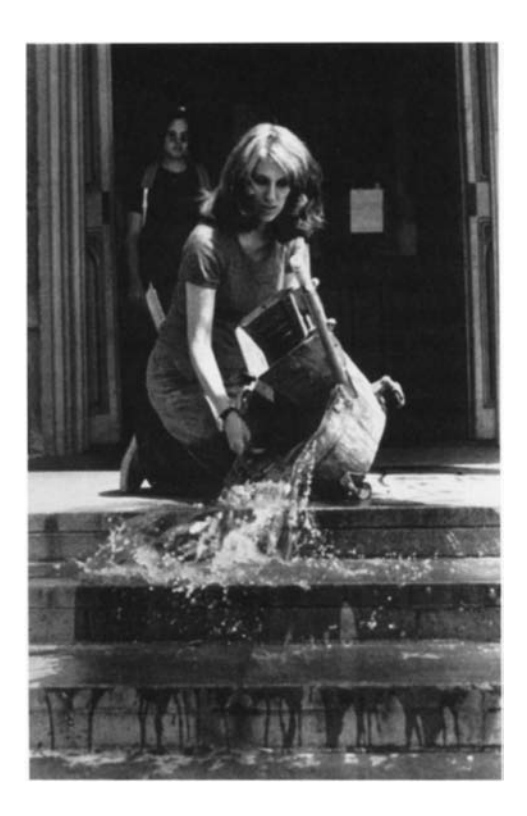
Mierle Laderman Ukeles. Hartford Wash from the series Maintenance Art Activity at Wadsworth Atheneum, Hartford, Connecticut. 1973.