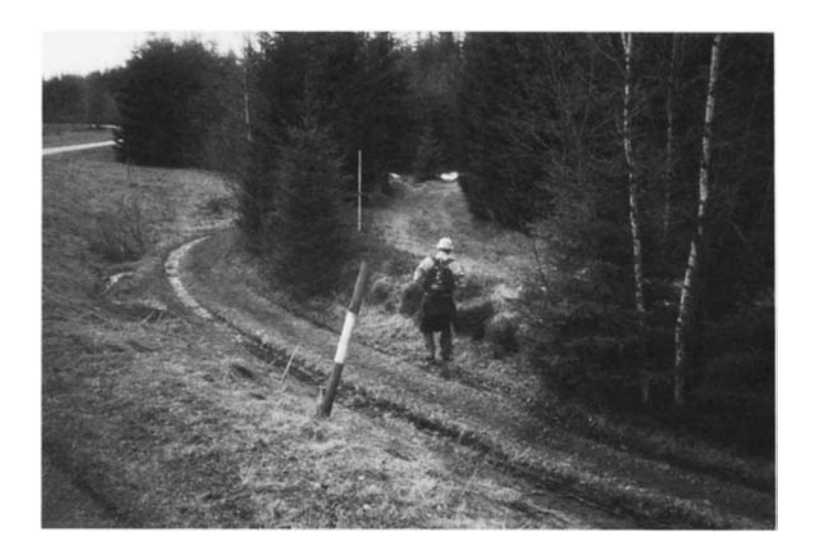
Christian Philipp Müller. Illegal Border Crossing between Austria and Czechoslovakia. (Austrian contribution to the Venice Biennale.) 1993.

the institution and/or the city within which it is located (its history, constituency of the [art] audience, the installation space); consideration of the parameters of the exhibition itself (its thematic structure, social relevance, other artists in the show); and many meetings with curators, educators, and administrative support staff, who may all end up "collaborating" with the artist to produce the work. The project will likely be time-consuming and in the end will have engaged the "site" in a multitude of ways, and the documentation of the project will take on another life within the art world's publicity circuit, which will in turn alert another institution for another commission.